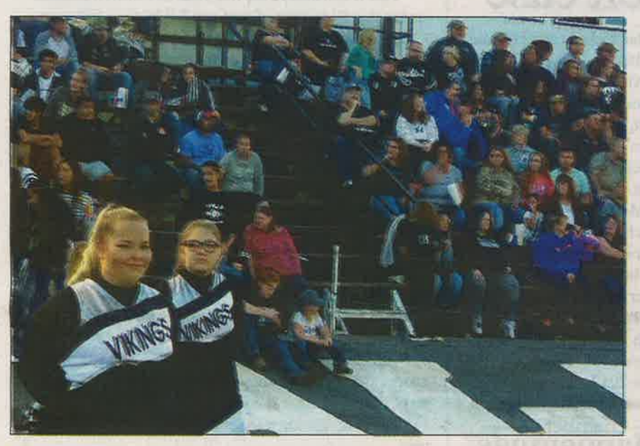
Above: Vale cheerleaders rally the spirits of the crowd. Below: Local ranchers and farmers are honored by the student body at a school assembly during homecoming week.